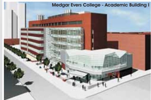
Medgar Evers College - Academic Building I

Providing quality engineering services for universities, schools, medical facilities, laboratories, hotels, television studios, transportation facilities, water treatment and sewage treatment facilities and more for over 10 years .